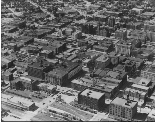
Thursday, September 21 A Snapshot of the 1940s