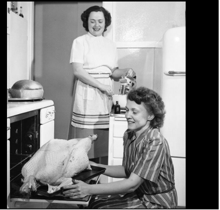
Thursday, November 16 A Candid History of Thanksgiving