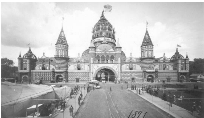
9. 1891 Corn Palace