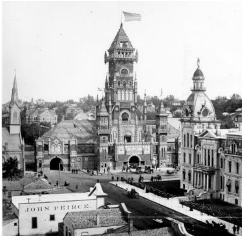
9. 1889 Corn Palace