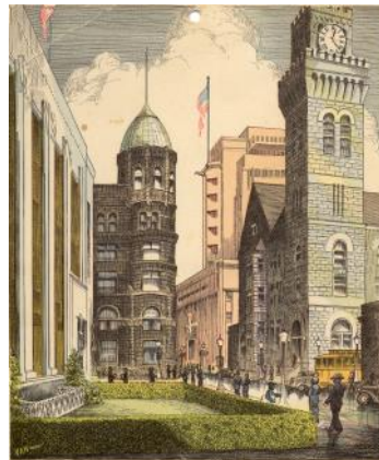
11. Government Corner, 1940s