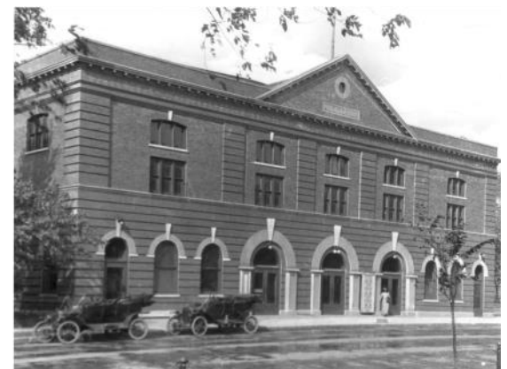
12. Municipal Auditorium