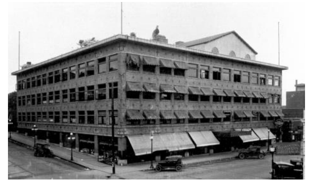
5. Commerce Building