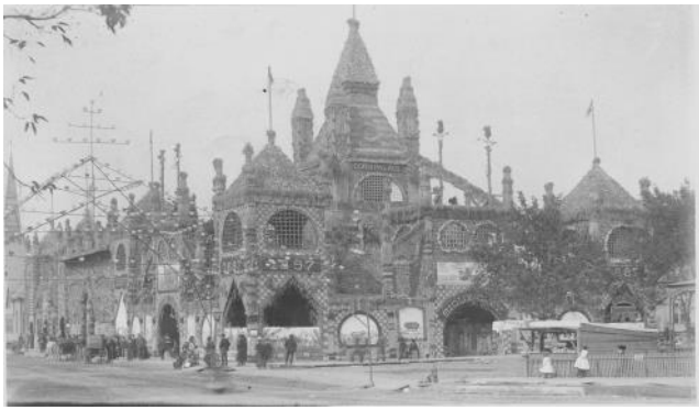
3. 1887 Corn Palace