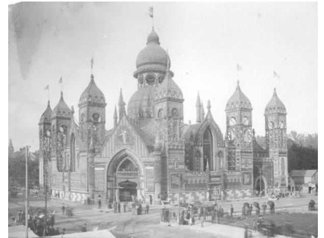
9. 1890 Corn Palace