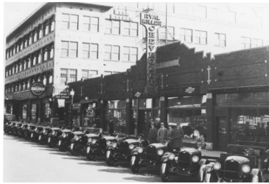
4. Kemp Building